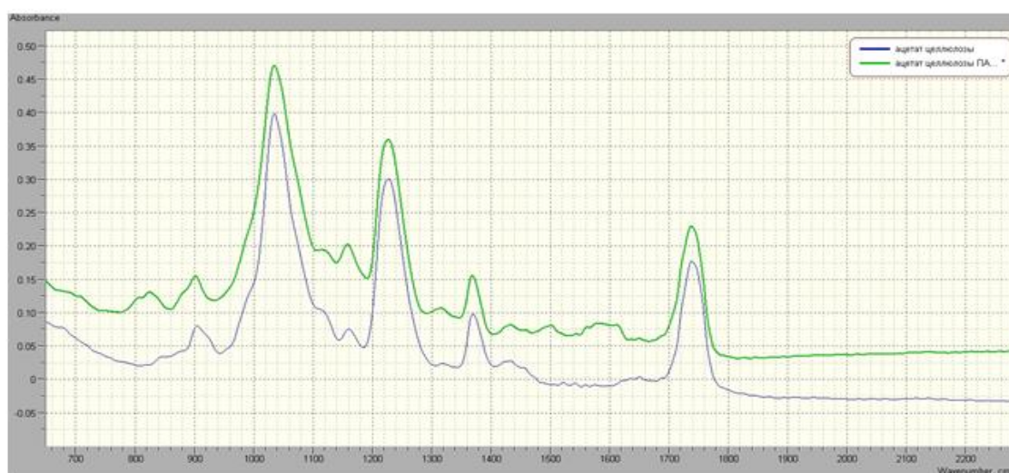
Figure 3. Infra red absorption spectra atsetatatsellyulozy: lower - atsetatatsellyulozy, upper - the system cellulose-PANI acetate (AC-PANI)

Figure 3 shows the Infra red absorption spectra of polyaniline initial and modified cellulose acetate membrane.